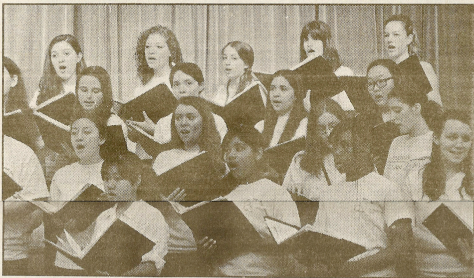
The mixed choir.