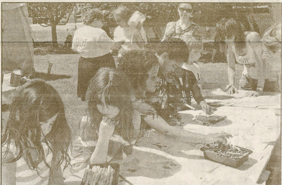
Kids enjoyed art projects that were offered during the day.