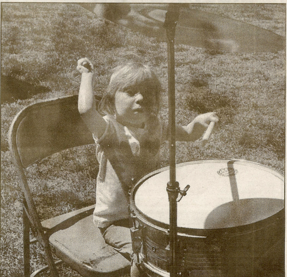
A little girl plays the drums.