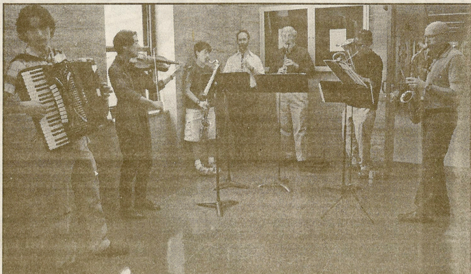
A Klezmer band performed during PortFest.